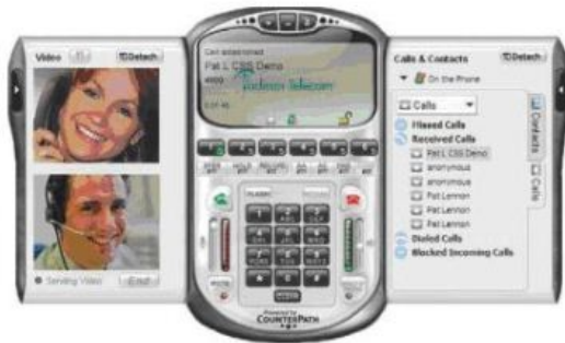
Coral SeaBeam Softphone

With Tadirand's state-of-the-art presence management and productivity tools, you have total control and unified communications.